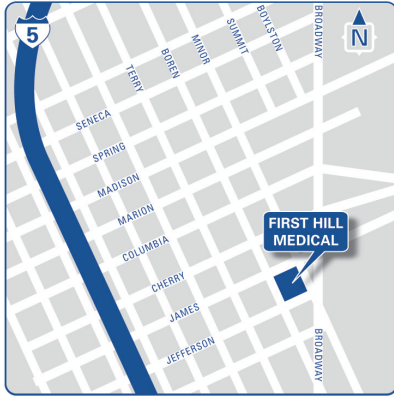
First Hill Medical Building 515 Minor Avenue Seattle, WA 98104