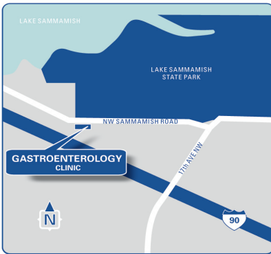
Swedish Medical Center • Issaquah 2005 NW Sammamish Road Issaquah, Washington 98027